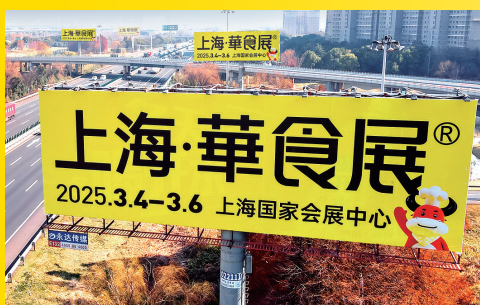
Shanghai Hangzhou Highway and Shanghai Jiangsu Highway